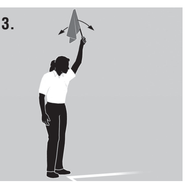
Obtain R1's Attention